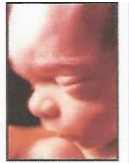
20-week baby in the womb

Please contact me and let me know how you will respond to this request.